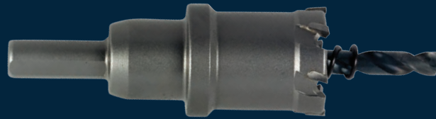
CT7 Carbide Tipped Hole Cutters