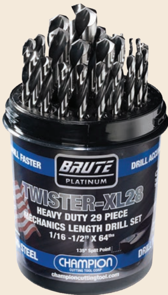
TWISTER- XL28LOGO Heavy Duty Drill Set