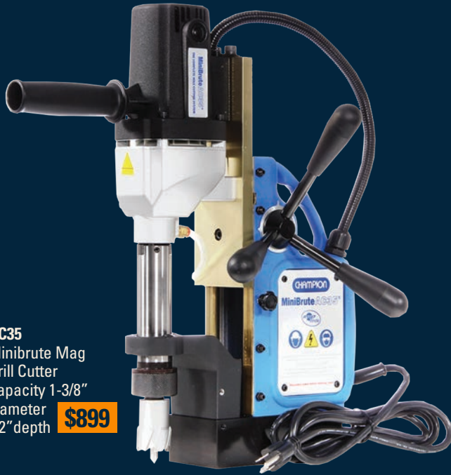
AC35 Minibrute Mag Drill Cutter Capacity 1-3/8" diameter x 2" depth $899