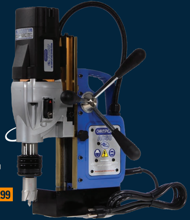
AC50 Mightibrute Mag Drill Cutter Capacity 2-1/8" diameter x 2" depth $1299