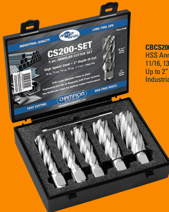
CBCS200-SETPROMO HSS Annular 5-Piece Cutter Set (9/16, 11/16, 13/16, 15/16, 1-1/16" + Pilot Pin), Up to 2" Depth of Cut, $200 VALUE Industrial Quality