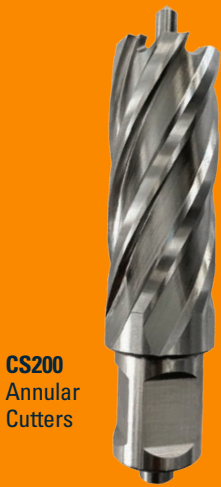
CS200 Annular Cutters

CONTACT LOCAL REP FOR SIZES AND AVAILABILITY.