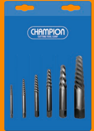
X1-1-6 Spiral Flute Screw Extractor Set