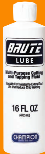
XLUB16 BruteLube Cutting Fluid