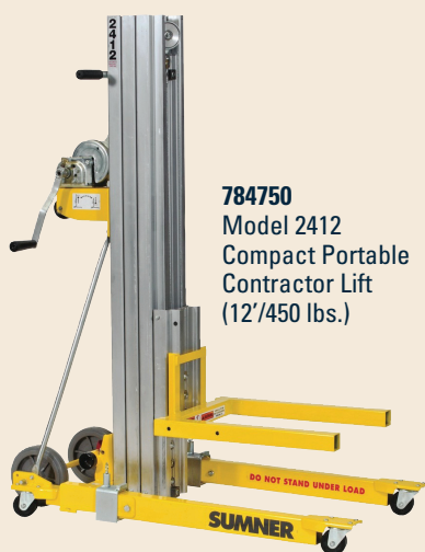
784750 Model 2412 Compact Portable Contractor Lift (12'/450 lbs.)

CONTACT REP ABOUT AVAILABLE GANTRIES, ROUSTABOUTS AND LIFTS NOT SHOWN. WHILE SUPPLIES LAST.