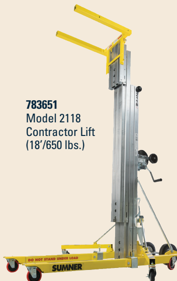
783651 Model 2118 Contractor Lift (18'/650 lbs.)