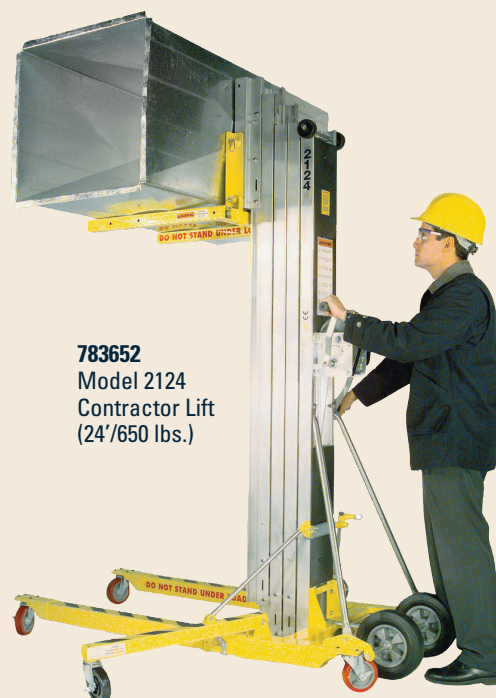
783652 Model 2124 Contractor Lift (24'/650 lbs.)