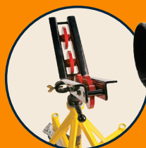
781403 Model MJAXKIT1 Max Jax™ 5-leg fabrication stand.