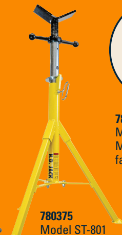
780375 Model ST-801 Heavy Duty Jack with Vee Head is a fixed leg stand constructed of rugged 1" steel tubing.