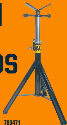
780471 Model ST-871 Pro Jack with Vee Head is an economical fixed leg stand.