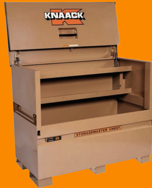
KN89 Model 89 STORAGEMASTER Jobsite Piano Box, 60" W x 30" D x 49" H, 16-Gauge Steel, Tan, 47.8 cu ft $1399