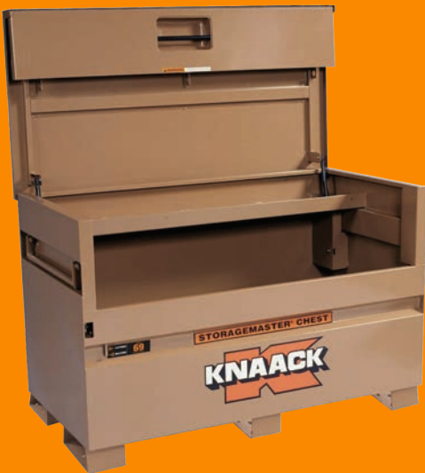
KN69 Model 69 STORAGEMASTER Jobsite Piano Box, 60" W x 30" D x 34.25" H, 35.3 cu ft $1299