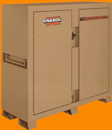
KN109 Model 109 Jobmaster® Cabinet, 60" W 24" D x 60" H, 47.5 Cu. Ft., Steel, Tan $1899