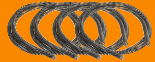
C-11 CABLE: QTY 4 (1-1/4" X 15') Cat. #62280