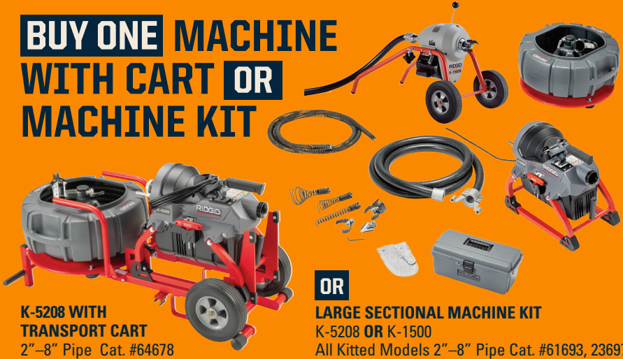
K-5208 WITH TRANSPORT CART 2"-8" Pipe Cat. #64678

BUY ONE MACHINE WITH CART OR MACHINE KIT