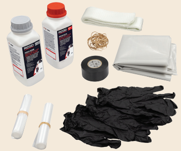
2" PIPE X 32" REPAIR Cat. #74693 VALUE $397