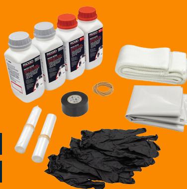
Cat. #74718 VALUE $1,235